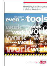
PROTECT by Leica Geosystems Brochure