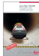
Leica Piper 100/200 Brochure