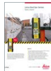
Leica Rod Eye Series Data sheet