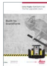
Leica Rugby CLA/CLH/CLI Brochure

Illustrations, descriptions and technical data are not binding. All rights reserved. Printed in Switzerland – Copyright Leica Geosystems AG, Heerbrugg, Switzerland, 2018. 812719en - 08.18